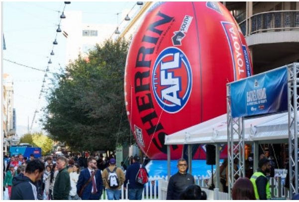
Rundle Mall Activations