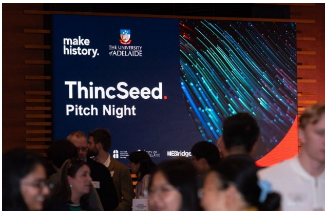
Strategic Partnership Program

MTPConnect's Global Navigator Program has assigned mentors to participating companies and begun workshops to help define market entry strategies for the companies.